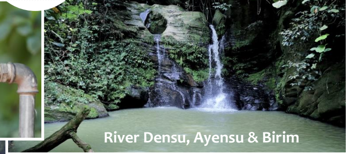
River Densu, Ayensu & Birim

▶ Bauxite mining will DESTROY the forest and its natural systems that ensure continuous water flow.