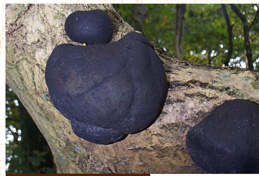
SN: Daldinia concentrica CN: Cramp ball fungus

USES: Antioxidant. Can be used to treat infections and help improve stomach upset like ulcers or wound whistles. Contains Vitamin A, B, and C and contributes to strengthening the immune system