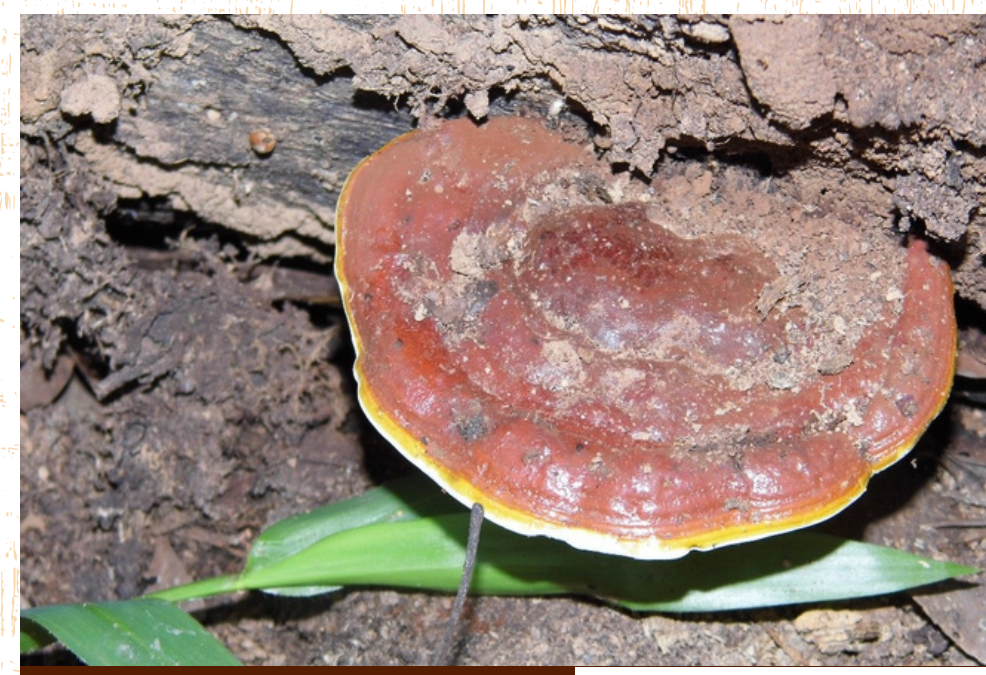
SN: Ganoderma sp. CN: Monkey Seat

USES: Helps decomposition of trees; has antibacterial properties; used by pharmaceuticals