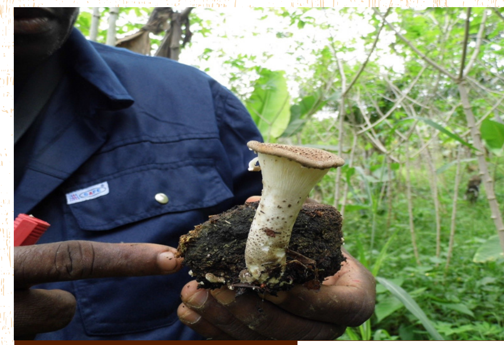
SN: Pleurotus tuber-regium CN: King tuber mushroom LN: Futrufu

USES: Medicinal properties; antioxidants can be used by pharmaceuticals in medicinal preparations for managing HIV patients. Also used to treat breast cancer