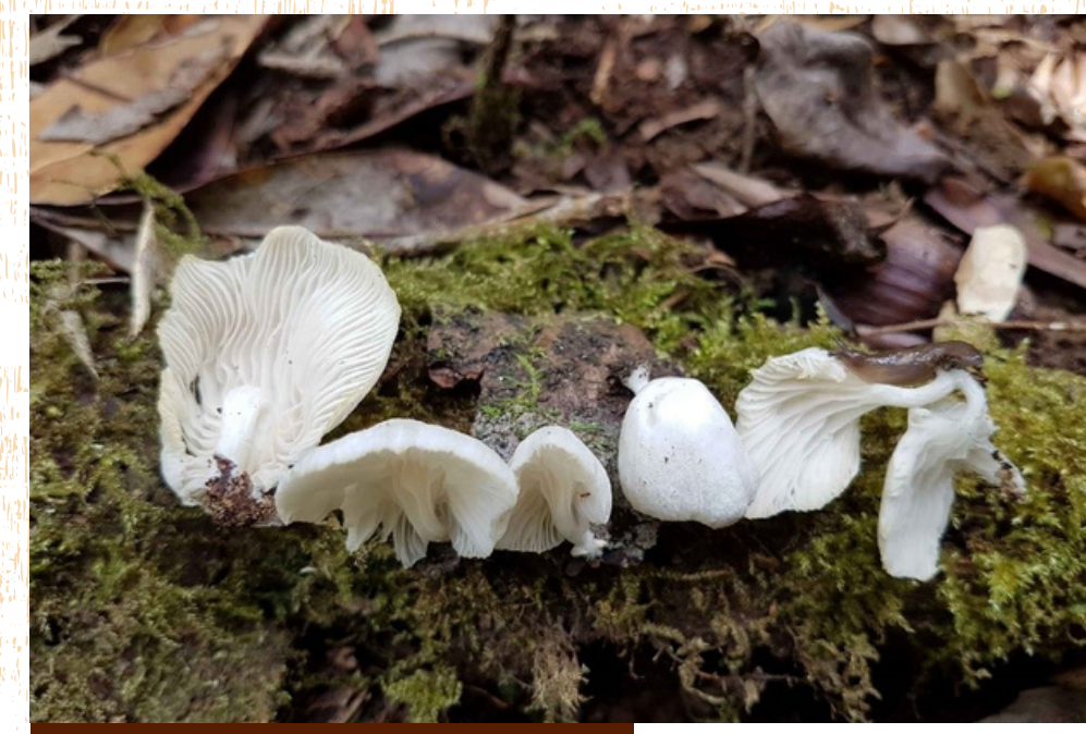
SN: Pleurotus albidus

USES: Has medicinal benefits for treatment of immunotherapy, cancer, neurodegenerative diseases; obesity and hyperlipidemia