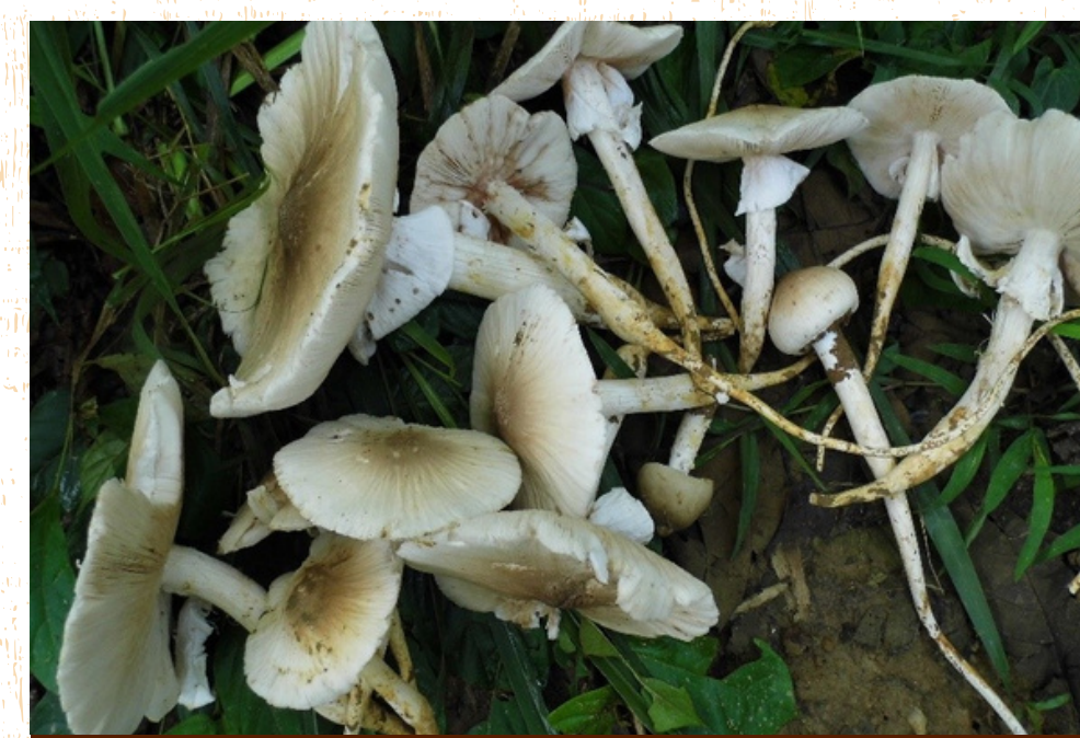
SN: Termitomyces sp. LN: Twearodo/Atwe woro

USES: Has medicinal properties (antioxidants, anti-inflammatory)