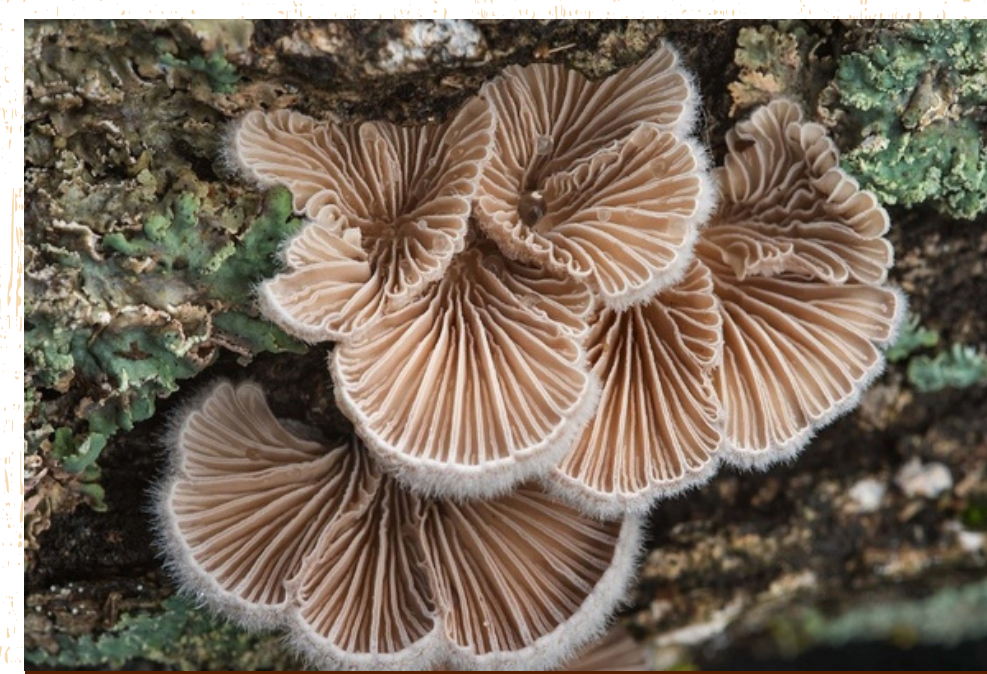
SN: Schizophyllum commune CN: Split Gill mushroom

USES: Has medicinal properties, may lower blood sugar; has antioxidant and anti tumor properties