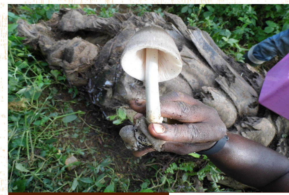
SN: Volvariella volvacea CN: Straw Mushroom LN: Domo

USES: Food, medicine, and tool for bioremediation