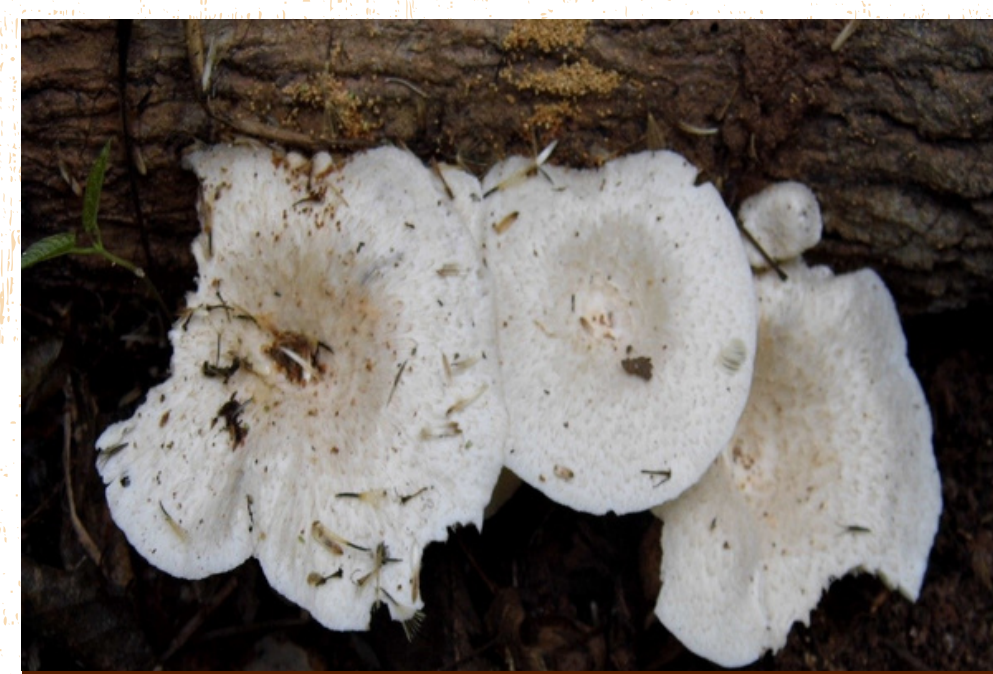
SN: Lentinus squarosullus

USES: Has antioxidant properties; it is used by pharmaceuticals; improves soil fertility