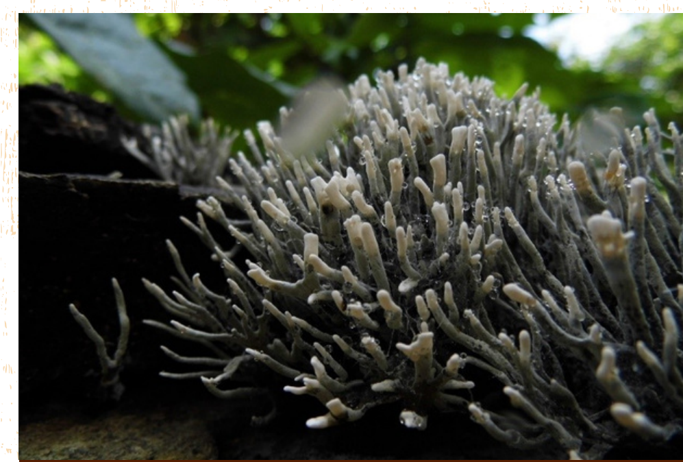
SN: Xylaria polymorpha CN: Dead man's fingers LN: Mmire nasatea/ owufo nsatea

Scientific Name: SN Common Name: CN Local Name: LN