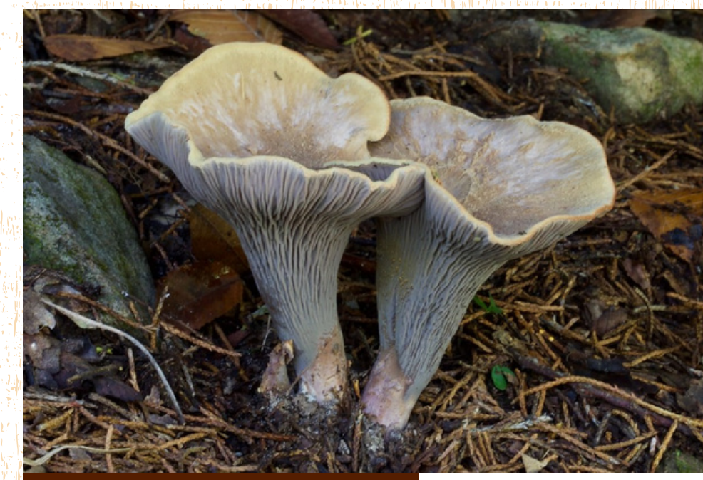
SN: Gomphus sp.

USES: Medicinal and anticancer properties