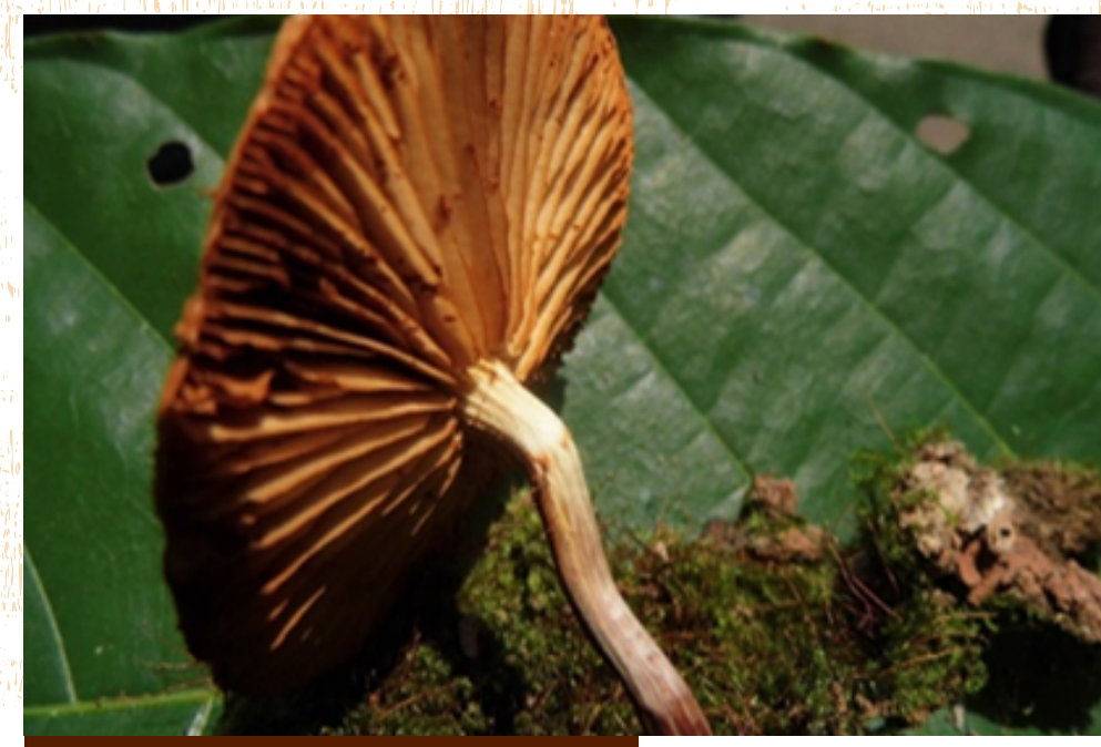
SN: Gymnopilus sp. CN: Black fungus/ Wood ear LN: Nkankom

USES: Traditional medicine for treating high cholesterol, high blood pressure and headache. Can also be used as a laxative