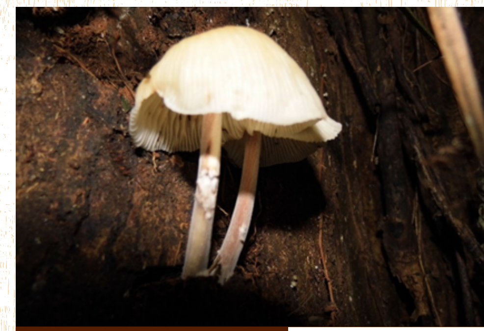
SN: Collybia piperata

USES: Can be eaten as food and has medicinal properties