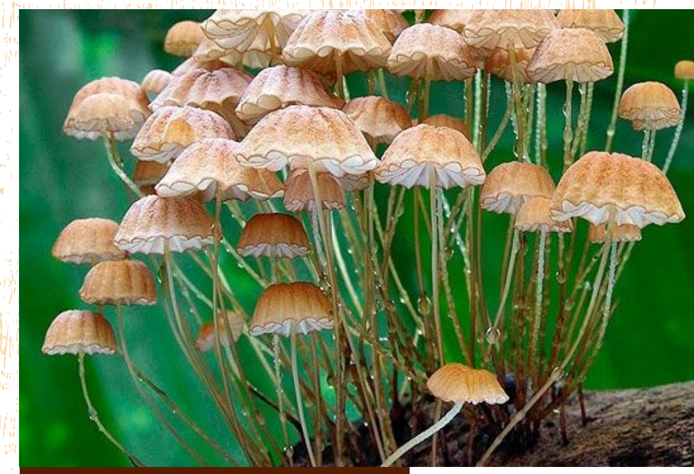
SN: Marasmius sp.

USES: Can be eaten as food and has medicinal properties