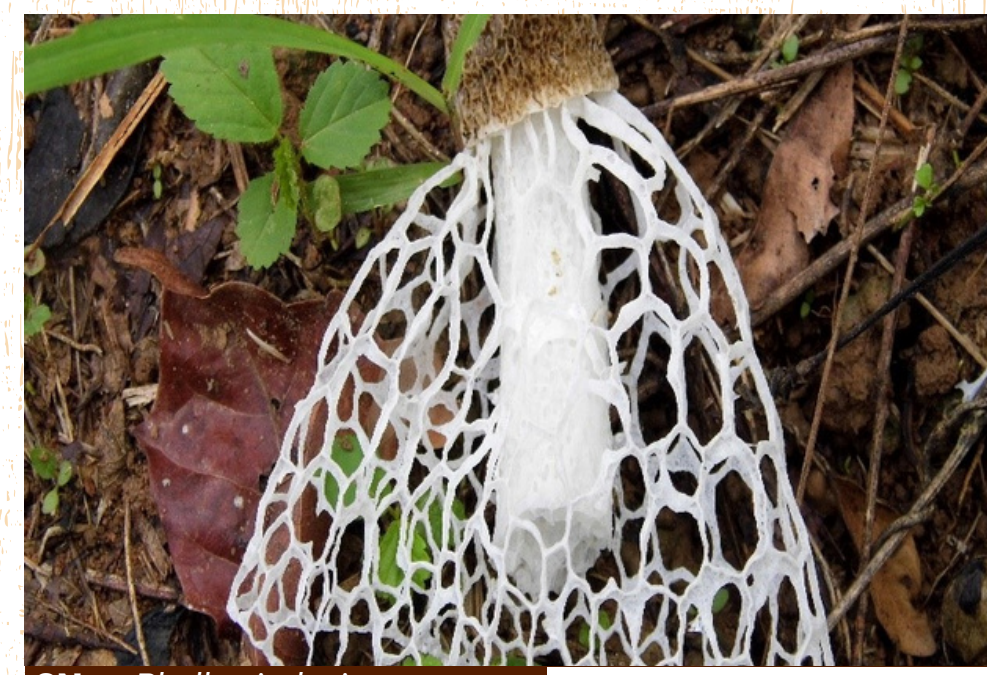
SN: Phallus indusiatus CN: Bridal veil LN: Saman kote/ Saman mire

USES: Can be eaten as food and has medicinal properties