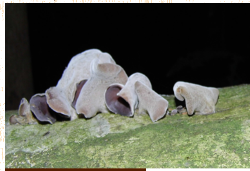
SN: Auricularia polytricha CN: Black fungus/ Wood ear LN: Ase mire

USES: Has medicinal properties—antioxidant