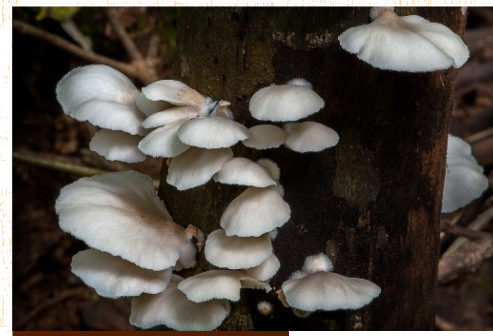
SN: Pleurotus sp. CN: Oyster mushroom LN: Mbrefuofu

USES: Has medicinal benefits for regulating cholesterol