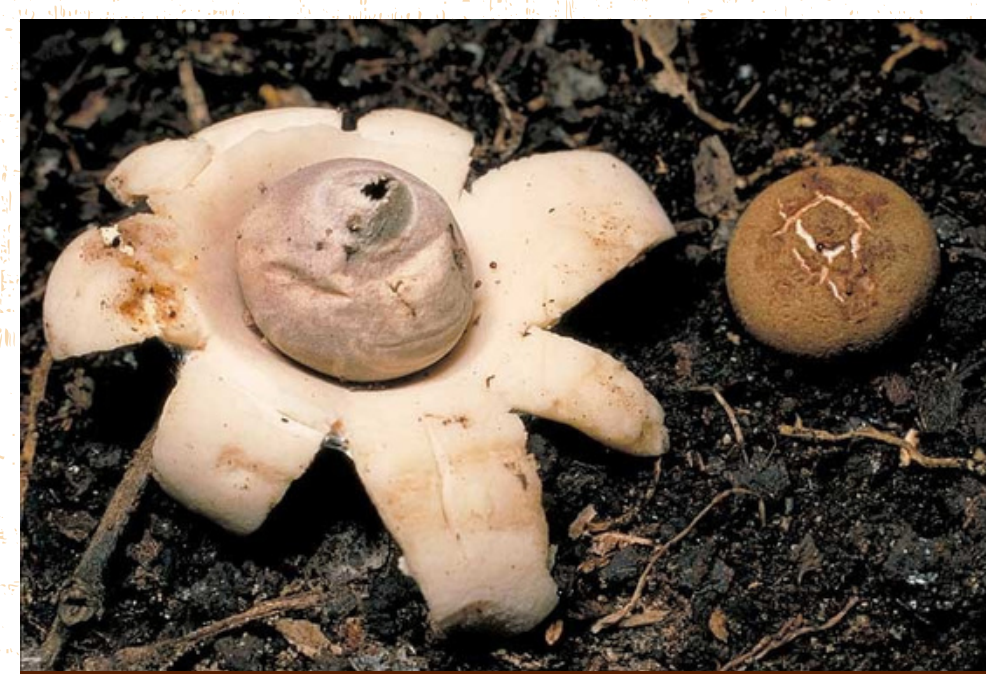
SN: Geastrum saccatum CN: Rounded Earthstar LN: Efufo

USES: Eaten in some parts of Africa and has medicinal properties